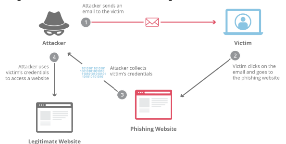
Fig:- Phishing Attacks

Phishing is the another deceptive attacking method which hacker assumes the identity of reliable third party and exploits that identity—either stolen or made up—to obtain the user's personal data. For instance, key U.K. and U.S. military officials were duped into becoming Facebook "friends" with person posing as U.S. Navy Admiral James Stavridis during an attack that the Chinese government claimed was the result intelligence [17]. The same way that phishers frequently exploited social media and adopted aliases [18–20]