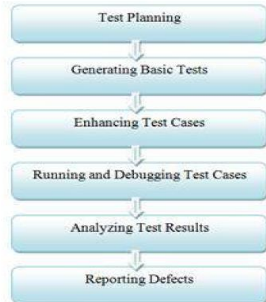
Figure 3.1: Selenium Testing Process

Selenium Testing Process consists of following phases: