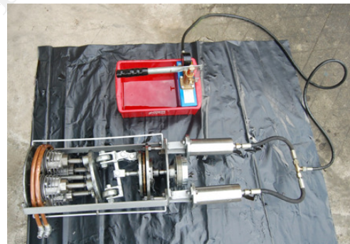
Fig.3. Pistons reciprocate for the rotation of inclined driving arm