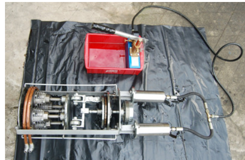
Fig.2. Driving arm horizontal, no piston movement for driving arm rotation

is to be increased, stroke control disc is brought to lower resulting the control link to press the pressure roll end of driving arm more downward, so inclination of driving disc is more and degree of oscillation of disc is also more, hence piston stroke is also increased. When control sleeve is pulled upwards by stroke control disc, the driving arm position changes to discharge refrigerant less as now guide roll presses the driving disc towards horizontal plane and when driving arm is brought to horizontal position there will be no discharge from the compressor.