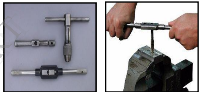
Figure 1: Tap Tools