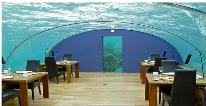
Fig-2:Ithaa undersea restaurant

The Ithaa Undersea Restaurant, located in the island nation of Maldives, is a breath taking acrylic structure located 16 feet below seal evel. Constructed almost entirely of transparent acrylic, the restaurant offers its patron span or a mic views of the marine life surrounding the restaurant. The restaurant, which is roughly 500 square feet, was built using the float and lower method. After being assembled in Singapore, Ithaa was transported on a barge, then lowered with the help of sand bag son to steel-driven piles that form its foundation. The estimated life span of the restaurant is 20 years. Once constructed, Ithaa would be winched into the water. Technical challenges, limited resources, and quality control problems in building a structure of 175 tonnes in the Maldives were foreseen. Hence, a decision was made to build Ithaa in Singapore instead.