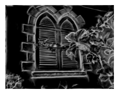
(a) Reference image

(f) JPEG transformation errors Fig.2: Reference image and distorted versions of reference image in TID2008 database.