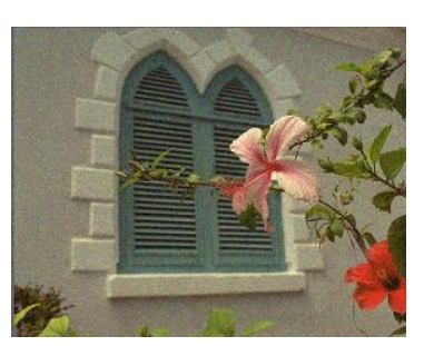
(b) additive Gaussian noise