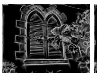
(e) JPEG2000 compression

Fig.3: PC maps extracted from images 4a ~ 4f, respectively.