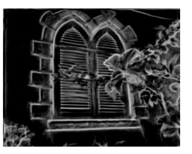
(c) spatially correlated noise

Fig.3: PC maps extracted from images 4a ~ 4f, respectively.