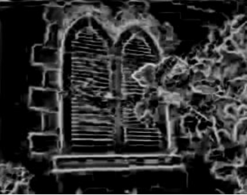
(f) JPEG transformation errors