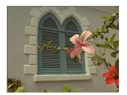
(a) Reference image

Fig.1. If the chromatic information is ignored in Fig, the FSIMC index is EXPERIMENTAL RESULTS: