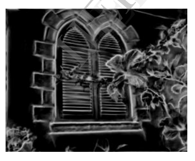
(b) additive Gaussian noise