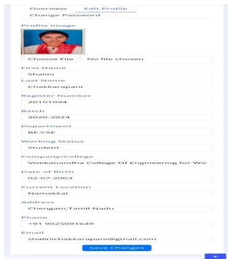
Figure6 Profile Updation Page