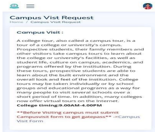
Figure3 Campus Visit Request Page