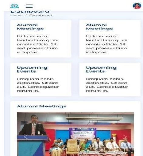
Figure4 Dashboard Page