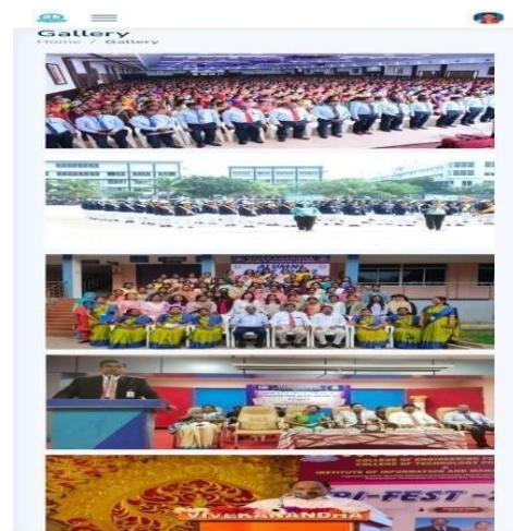
Figure5 Gallery Page