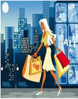
Figure.1 Original image