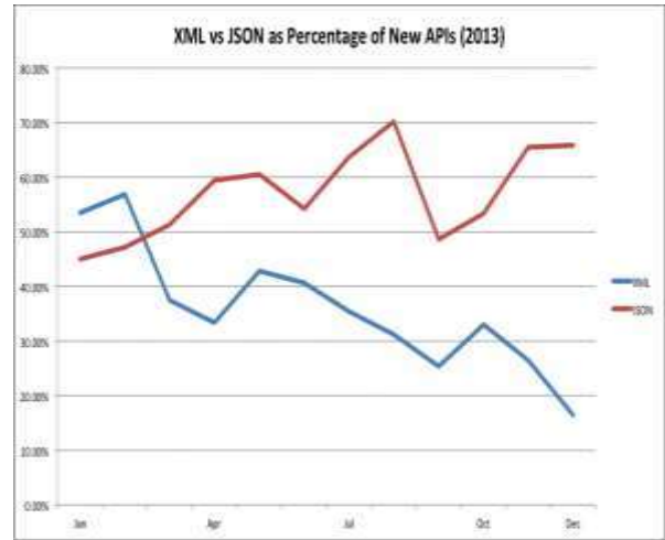
2. Percentage APIs of XML vs JSON

They calculated the efficiency in both the sides i.e. server side and client side in terms data sending with the help of xml, same with the help of the JSON as the compared results suggests that JSON performs well over the AJAX wee applications.