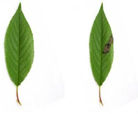
Fig 2: Healthy and diseased image of plant