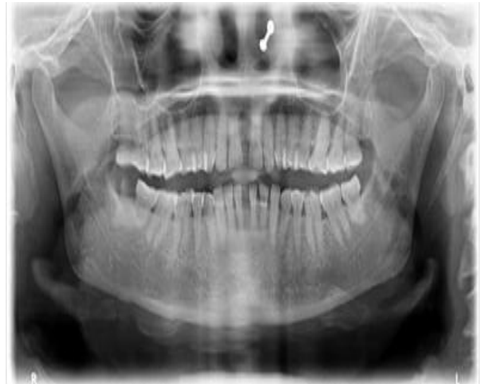
Figure 2 original image