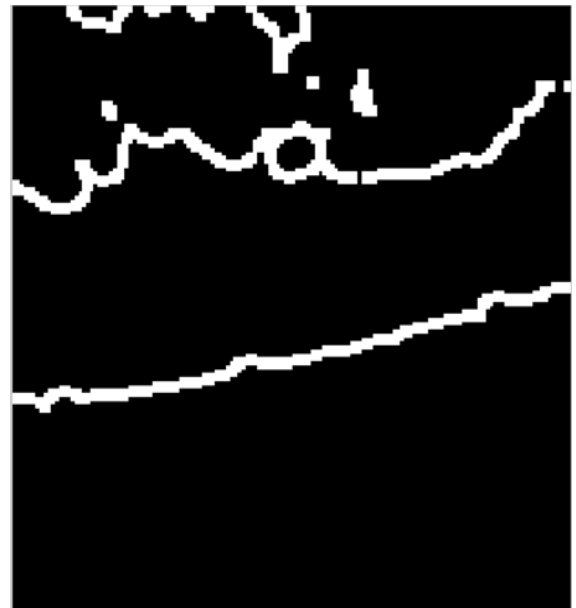
Figure 7 Smoothing image

Distance points P = 102.000, 90.000 D = 12.000 in pixels