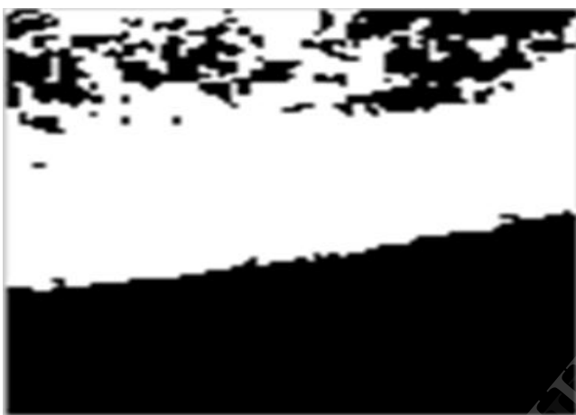
Figure 5 Clustered image