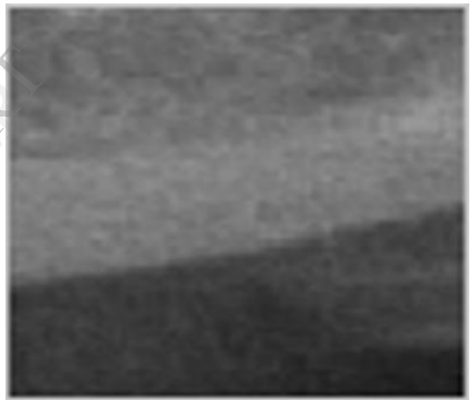
Figure 3 Cropped image