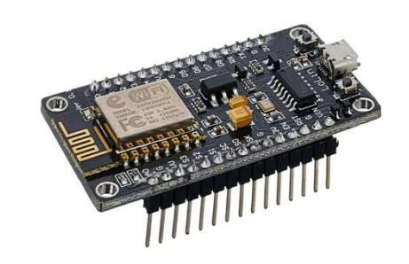
Fig 5.1 Node MCU

NodeMCU is an open-source Lua based firmware and improvement board uniquely focused on for IoT based Applications. It remembers firmware that runs for the ESP8266 Wi-Fi SoC from Espressif Systems, and equipment which depends on the ESP-12 module.