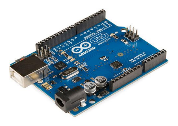
Fig 5.2Arduino Uno Board

The Arduino Uno R3 is a microcontroller. It has 14 computerized input/yield pins (of which 6 can be utilized as PWM yields), 6 simple information sources, a 16 MHz