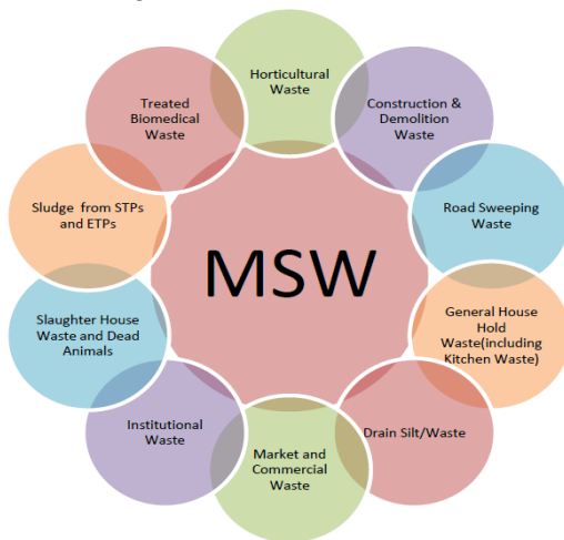
Figure 1. Source of MSW Generation

contains all kinds of garbage including newspapers, yard waste, old appliances, household garbage, used furniture and just about anything we can think of that people throw away at home, schools, and businesses. As per Toolkit for Solid Waste Management (Ministry of Urban Development, 2012) Waste generation encompasses activities in which materials are identified as no longer being of value (being in the present form) and are either thrown away or gathered together for disposal. Municipal Solid Waste consists of the following kinds of waste.