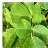
a)Segmented image b)Original image