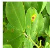
a)Segmented image b)Original image