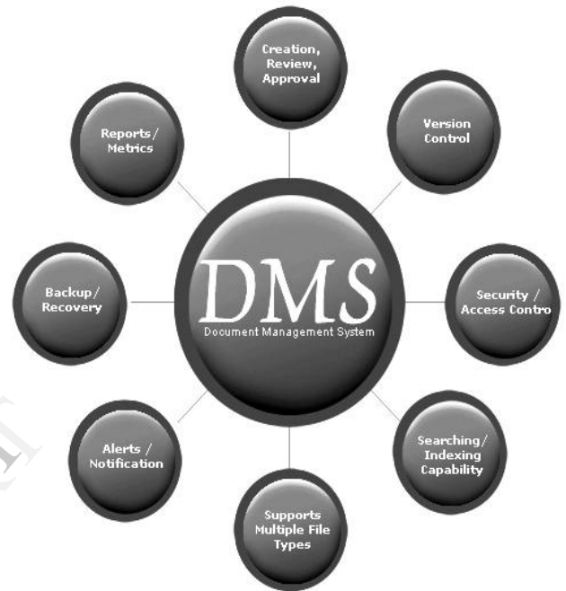
Figure: 1 Architecture: Document Management for the Masses