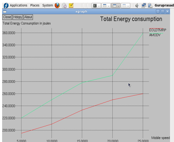
Fig 4. Total Energy Consumption against mobile speed(m/s)