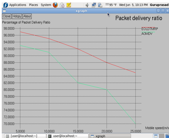
Fig 2. Packet Delivery Ratio against mobile speed(m/s)