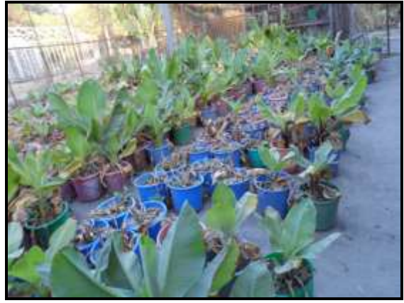
Figure 3. Field pot experiment to detect water requirement of enset.

at a seedling stage on altitude of 1687 masl, average monthly temperature, wind speed and relative humidity of 19.5^{\circ} c, 0.31ms<sup>-1</sup> and 56.57 % respectively.