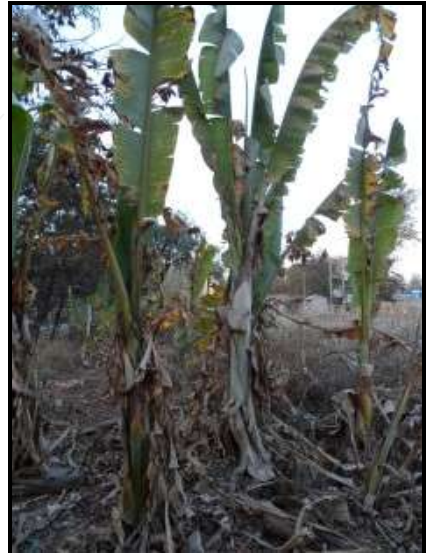
Figure 4: A two years old enset plant after seven months of water stress.

At the same environmental condition, a 2 years old enset plant tolerated a seven moth water stress with minor pseudostem dry out (Figure 4).