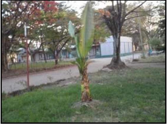
Figure 6. Ensete used for landscape beautification

All together make this plant a potential for guaranteeing household food security (Brandt et al, 1997, personal communication).