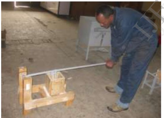
Figure 5. Simple lever based kocho press.

The major food products obtained from the ensete plant are kocho, bulla and amicho, all of which are simple to produce once the plant is harvested, and can be stored for long periods without spoiling. Kocho bread is starch rich piece which is made from the fermented mixture of the decorticated leaf sheaths and grated corm. Combined with Ethiopia's spicy kitfo (minced meat), it is now an expensive dish in virtually all restaurants in the country. One of the tedious job in kocho processing is extraction of water from the fermented enset. A simple lever based technology (figure 4) designed by the author this time found very supportive for small scale farmers. With this technology, farmers can get rid of about 85% of the moisture in the raw product and easily expose all the fibres.