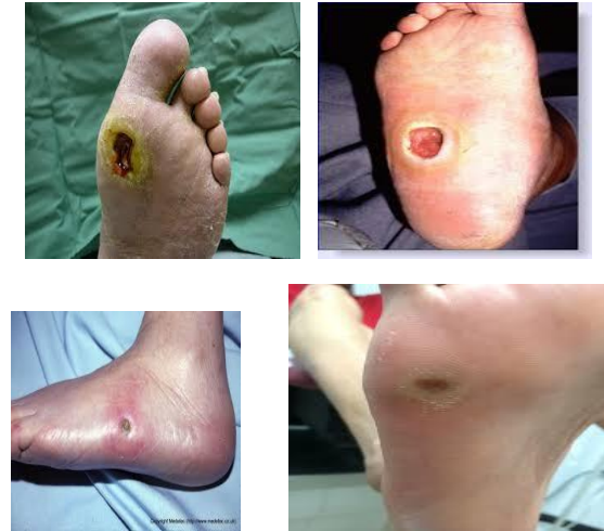
Figure 6.1 Wound images

The Image capture process is captured analyzed by the wound image by using Smartphone and stored in JPEG file. The image is compress with binary image. The image preprocessing process is captured by wound image in order to remove the noise by using Gaussian filter. The Image segmentation process is the original image can be convert into RGB color image in divided by pixels (256*256).The Wound boundary detection process is detected by the wound in outline. The wound are identify color is used.