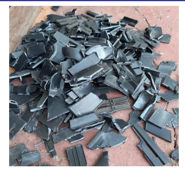
Fig 2: Crushed e-waste plastic