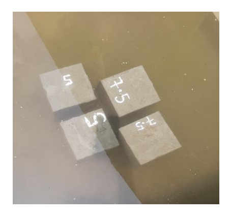
Fig 5: Cubes immersed in curing tank