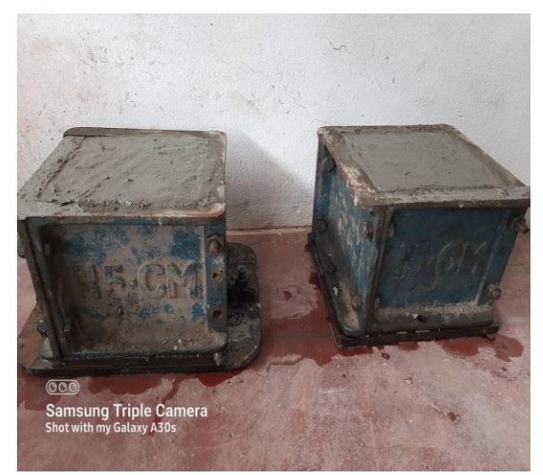
Fig 4:Cube moulds for compressive strength test