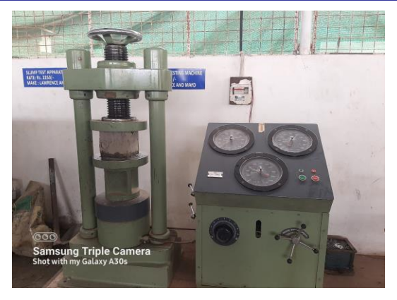
Fig 7: Compressive testing machine