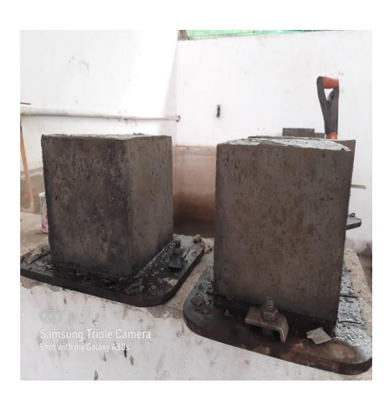
Fig 6 :Sample cubes after demoulded