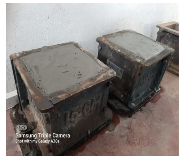
Fig 3:Cube moulds for compressive strength test