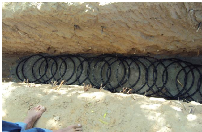
Fig 2.2 Coiled form of the pipe used in the setup

Description: The EAPHE as shown in fig .1 comprise of air blower through which outside air supply at 45°C passes through a PVC tube in coiled form. Subsequently air passes through the anemometer to measure the velocity of air. Air flowing in the coiled pipe along the horizontal length of 12 ft. As we know that the average temperature at stratum is 27° to 28° C. The soil provides a good inertia to climate change during summer and winter seasons as the depth increases. When the supply air passes through tube then heat transfer takes place between air and cold soil temperature under ground level. Due to which air get cooled, after words the air passes through the indirect type heat exchanger. In which air flowing through pipe and the cold water circulating from induced type cooling tower, due to which heat transfer between air and cold water takes place and the air get re cooled by virtue of coldness of water. Cold water gets heated by heat exchanging to the warm air and recirculated back to the cooling tower with the help water circulating pump. In such a way the temperature of supplied air will be decreases up to 10-15 °C. The conditioned air supply to various air handling units.