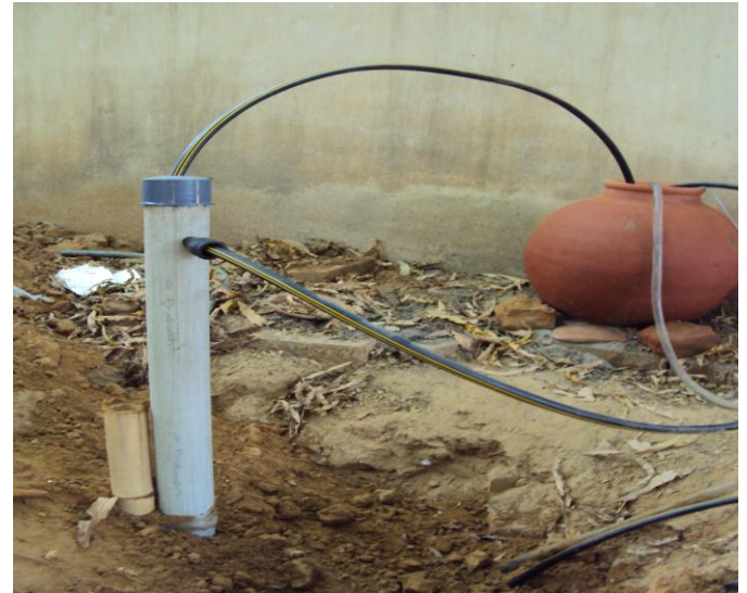
Fig 2.3 Showing the cooling water jacket