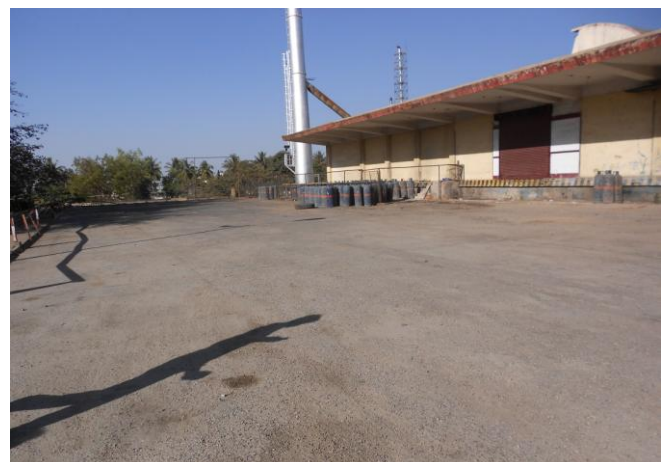
Fig 6: Existing Production block of the BAMUL, KMF

The production block of Bangalore dairy, BAMUL, KMF Pvt Ltd has been investigated for the feasibility of the structure to accommodate an additional floor in the existing building, A detailed feasibility study was carried out at the site to assess the suitability of the structure to take up the load of the proposed additional floor