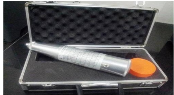
Fig 1. Rebound hammer

Rebound hammer is the oldest technique used to assess the compressive strength of concrete indirectly and also to compare the various parts of structure. Schmidt rebound hammer is the instrument for this test. Schmidt rebound hammer shown in Fig1 is a simple, handy tool, which can be used to provide a convenient and rapid indication of the compressive strength of concrete. It consists of a spring controlled mass that slides on a plunger within a tubular housing.