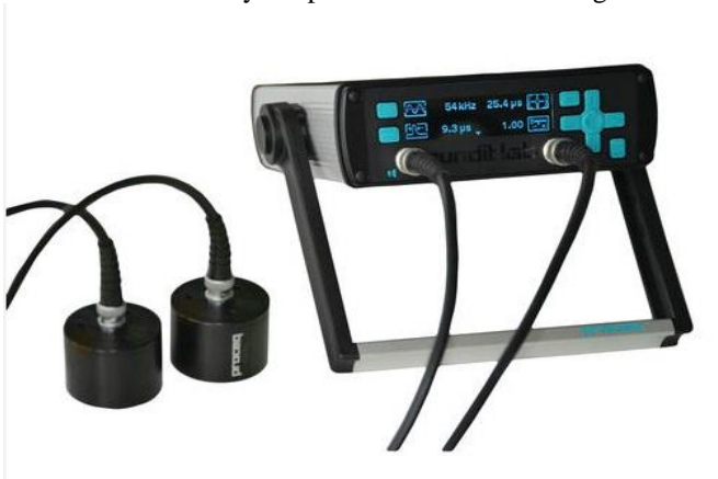
Fig 3. Ultrasonic pulse velocity testing instrument

T is the time taken by the pulse to traverse that length.