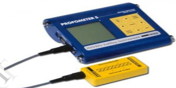
Fig 5 Cover meter

Electromagnetic cover meters can be used for: quality control to ensure correct location and cover to reinforcing bars .investigation of concrete members for which records are not available or need to be checked. Cover meter not only gives the details of concrete cover but also the steel used and the location of the steel. location of reinforcement as a preliminary to some other form of testing in which reinforcement should be avoided or its nature taken into account, e.g. extraction of cores, ultrasonic pulse velocity measurements or near to surface methods