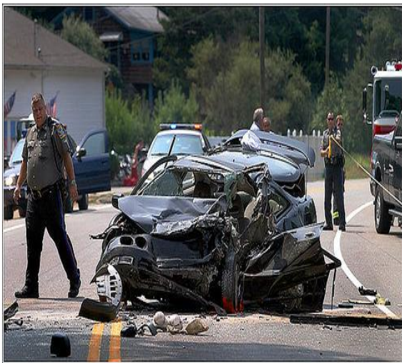
Fig1. Accedident due to exceed speed limit

There are many accidental cases which are because of exceeded speed limit especially on the highway, figure 1.1 shows the same. In case Police verification there is need to check the speed of the vehicle before the accident. Hence there is need of storing the speed so that one can get what was the speed?