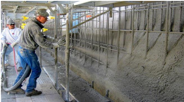
Fig. 2. Shotcrete overlays are sprayed onto the surface of a masonry wall over a mesh of reinforcing bar: 6-13mm diameter at 25-120.