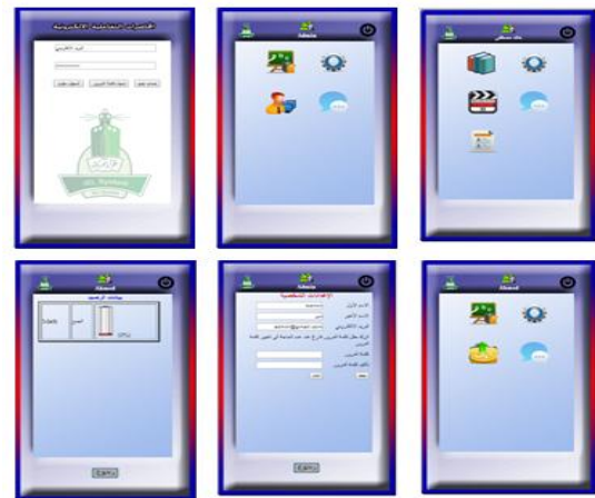
Figure 3.4: IELS Screens

phase all plans and storyboards can be converted into a viable work [10]. Draft versions of the whole system can be generated in this phase and unsolved issues and problems may appear which might inspire the designer to predict appropriate solutions. As the target of this experiment is an Arabic student, therefore IELS screens were designed in their language as shown in Fig 3.4