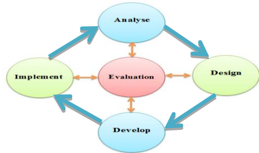
Figure 3.2: ADDIE Model

will be developed and created, therefore the following subsections have been applied. Fig3.2 shows the ADDE circle.