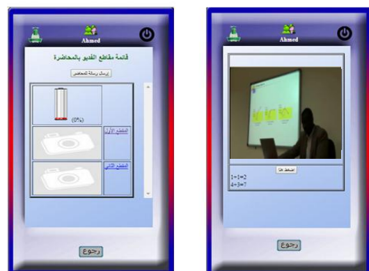
Figure 3.5; IELS Action test

In this phase the IELS system was uploaded to URL www.ielsystem.com to check that it is working smoothly. IELS features and content were tested such as register as a new user, sign in, sign out, edit personal settings, upload lecture clips, and test the IELS actions. This is also to verify that the system is working properly. Fig 3.5 shows some of the IELS screens when testing the system.