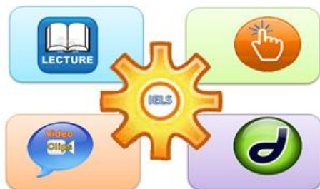
Figure 3.1: IELS

IELS is a web application that contains a number of elements developed together by using the PHP language to form the Interactive Electronic Lecture System (IELS). Fig 3.1 shows the elements of the system. The IELS consists of a number of main components, including lectures, video clips, and interactive interfaces. The IELS delivers lectures to undergraduate students in a novel format that creates an interactive environment which enables students to interact with the lecture content as well to communicate with other system users such as their lecturers and colleagues. Simply the IELS, is a lecturing application that has a flexible format for any module, can be uploaded as short clips and then certain interactive actions can be carried out which enable users to interact with the lecture contents.