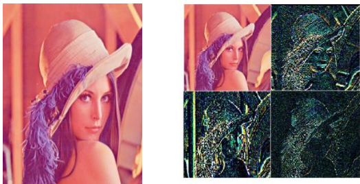
Fig. 1.single level wavelet decomposition

For wavelet filtering of 2-D image, discrete wavelet transform is used. As DWT gives multiresolution analysis of the cover image at different scales and levels. The resolution of the signal is a measure of the amount of detail information in the signal. The resolution of signal is changed by the filtering operations and the scale is changed by the upsampling and downsampling techniques. This is done even using DWT2 in Matlab. In Matlab, there are many wavelet filter families as Haar, Daubechies, Bio-orthogonal, and Symlet wavelet transform. The single level wavelet decomposition gives four subbands of an original image as low low frequency subband (LL), low high frequency subband(LH), high low frequency subband(HL) and high high frequency subband (HH). LL is an approximation of original image but scale down by factor of 2. The LH,HL,HH sub-bands are detail information of horizontal, vertical and diagonal details of downsampled original image. Image representation of DWT decomposition is representation as below