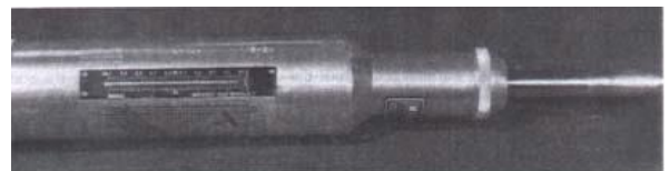
Fig 3: schmidt hammer

Using a spring-driven pin at a defined energy the test hammer hits the concrete, and then measures the rebound (in rebound units). The rebound depends on the hardness of the concrete. It is measured by test equipment. When conducting the test the hammer should be held perpendicular to the surface which in turn should be at and smooth. It does not work well for small samples and will make marks. By reference to the conversion tables, the rebound value can be used to find out the compressive strength. In several different energy ranges Schmidt hammers are available from their original manufacturers