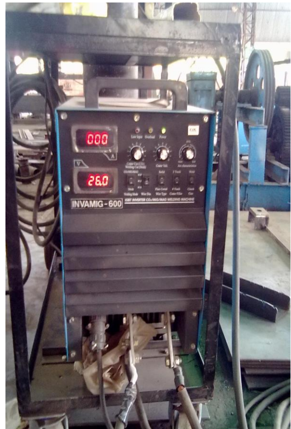
FIGURE NO. 1

To select an appropriate orthogonal array for experiments, the total degrees of freedom need to be computed. The degrees of freedom are defined as the number of comparisons between process parameters that need to be made to determine which level is better and specifically how much better it is. For example, a Three -level process parameter counts for three degrees of freedom. The degrees of freedom associated with interaction between two process parameters are given by the product of the degrees of freedom for the two process parameters. In the present study, the interaction between the welding parameters is neglected. Once the degrees of freedom required are known, the next step is to select an appropriate orthogonal array to fit the specific task. Basically, the degrees of freedom for the orthogonal array should be greater than or at least equal to those for the process parameters. In this study, an L09 orthogonal array was used. The input welding process parameters considered for this research work were wire feed rate (W), welding voltage (V), welding current (A). The output quality characteristic was dilution. All these parameters were investigated on 3 levels. The welding input variables and their limits are given Table 3. For avoiding systematic errors further in carrying out the experiments, 09 experiments were randomized for placing bead-on-plate welds on the ST-37 steel rod. The experimental layout for the