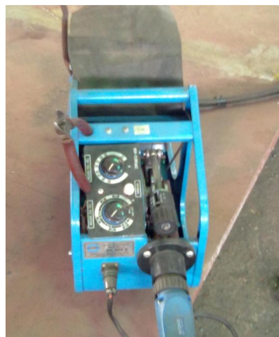
FIGURE NO. 2