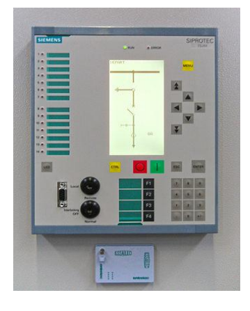
Fig. 3. Relay

• Relay - It senses the fault and sends the command to circuit breaker for tripping unhealthy parts from healthy parts. It prevents from damages to alternator or to transform. It can handle the high power required to directly control electric motors and other load.