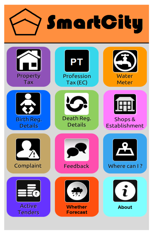
Fig 3: GUI of Smart City

Above figure shows basic or first look of GUI of the Application. It consists of various services offered by the application. It also consist of language switch key to change language of the User Interface according to user convenience.. Language switch will offer languages like Hindi, English, Marathi, etc.