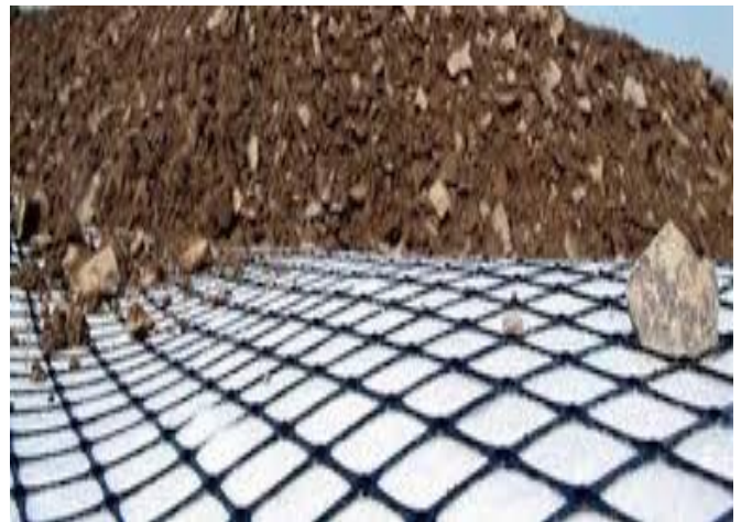
Fig.1 Aperture and ribs of geogrid

Geogrid provide significant improvement in pavement construction and performance. Figure 1 illustrates a number of potential geogrid applications in a layered pavement system to improve its performance. The reinforcement applications shown in Figure 1 can be provided by geogrids. These applications include subgrade stabilization, base reinforcement and asphalt reinforcement. Subgrade stabilization refers to situations where geogrid are placed on weak subgrade prior to the placement of an aggregate layer.