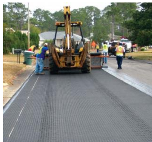
Fig. 2. Placing geogrids in pavements