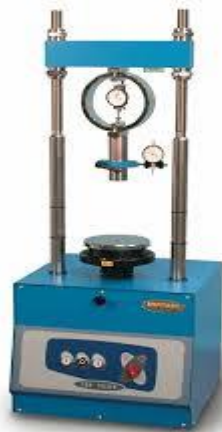
Fig.4. CBR Test Apparatus