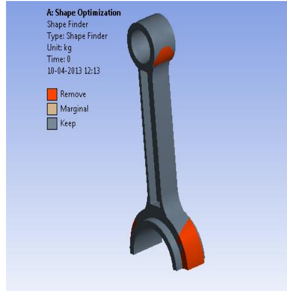
Fig3: Shape Optimization

Finite element analysis of connecting rod has been carried out for investigation of critical stresses, elastic strain and total deformation.