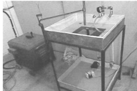
Figure 3. ECM Machine

The ECM machine was fabricated with power supply of 56 Volts at 300 Ampere current. The power output is provides to the electrode and workpiece by means of copper wires of high thickness to prevent its burning by high current values. Electrode is connected with negative supply and the workpiece is connected with the positive supply.