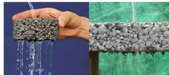
Fig (1). Porous concrete

Carefully controlled amounts of water and cementations materials are used to create a paste that forms a thick coating around aggregate particles without flowing off during mixing and placing. Using just enough paste to coat the particles maintains a system of interconnected voids.