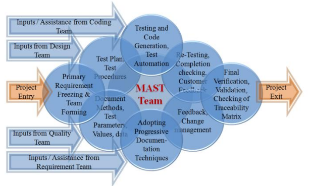
Figure 2: Functionality merger of MAST Team

factor, however, was the need to achieve culture changes essential to the full adoption of the new technologies. Team and individual training, strong and persistent encouragement from managers, and general recognition of the benefits of the new technologies were not sufficient. Progress did not begin until team members redefined their engineering practices, with the derivative effect of incorporation of the new technologies into these practices. Multidisplinary team practitioners may facilitate the introduction of technology in several ways. In redefining business practices to incorporate new technologies, they offer insight into work and information flows, cultural and organizational issues, and job functions and roles. This can help en gineering team members understand how the use of new tools can increase their efficiency.