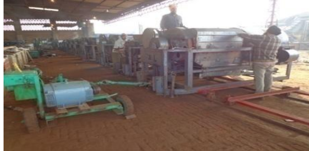
Figure 1: Assembly Line

a) At time of Assembly of threshers there is no sequence of work and these cause to Waste of time. After gives the suggestions Assembly of threshers working in line and this cause reduce the time of operation. The Assembly line of this Industry shown below: