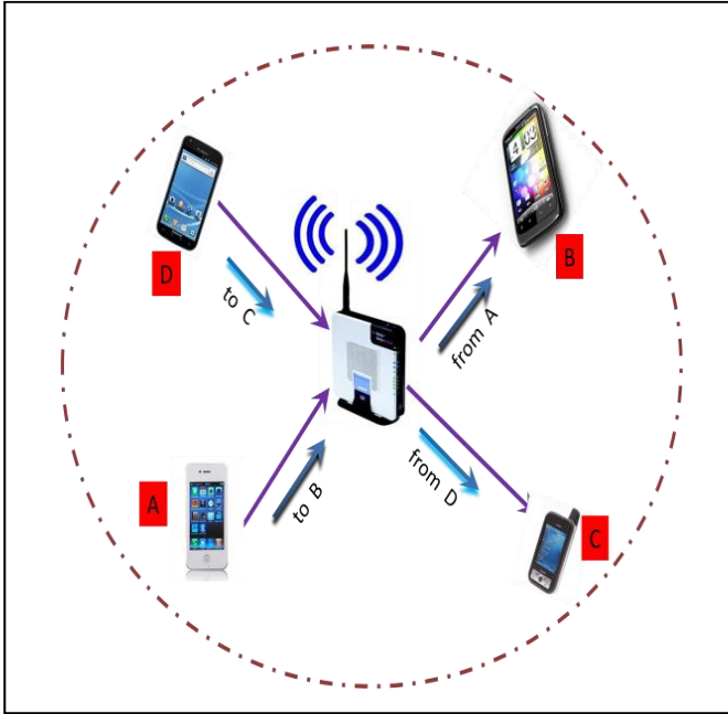
Fig.2: Simultaneous Voice communication

connected to the callee, he can start voice communication.