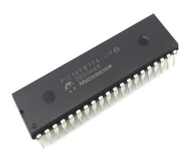
Fig 4.1 PIC Microcontroller

PIC stands for "Peripheral Interface Controller" and they are widely used in a variety of applications, including industrial control, consumer electronics and more.PIC microcontroller use a modified Havard Architecture, which seperates program and data memory.The Instruction set of PIC microcontroller is a RISC-based instruction set.PIC microcontrollers have various types of memory, including program memory, data memory and EEPROM memory.