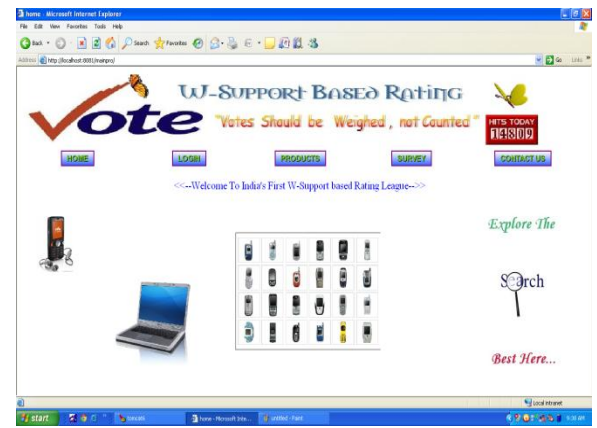
Figure 5.1 Home Page