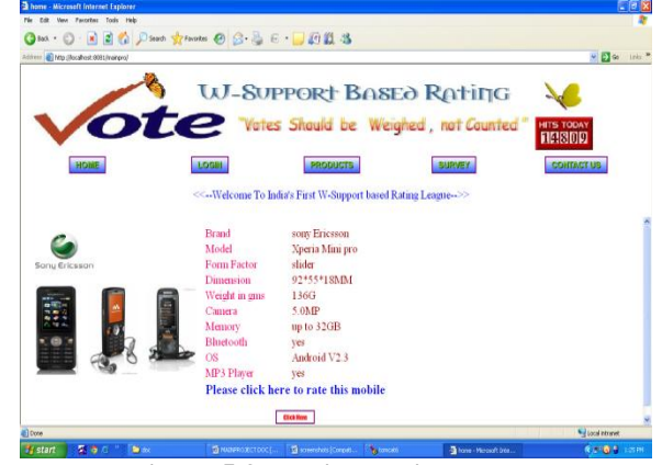
Figure 5.3 Mobile details page