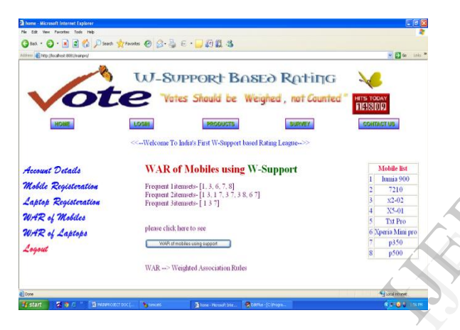
Figure 5.5 WAR of mobiles using W-Support