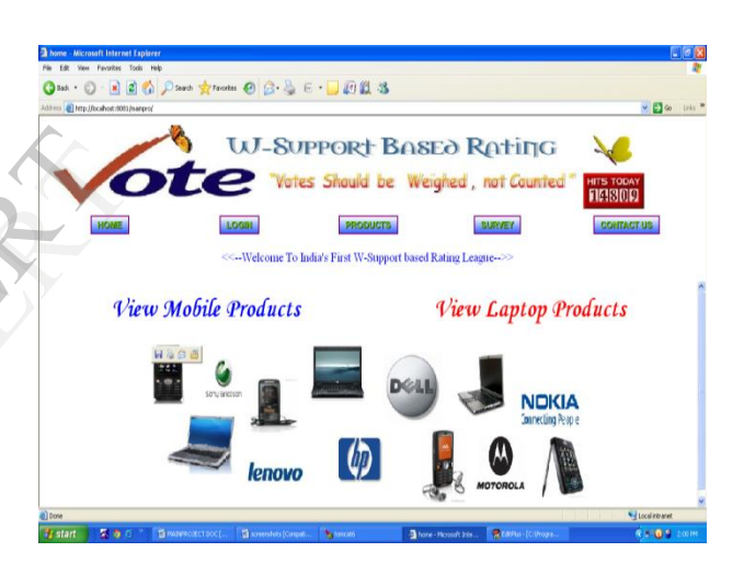
Figure 5.2 Product details Page