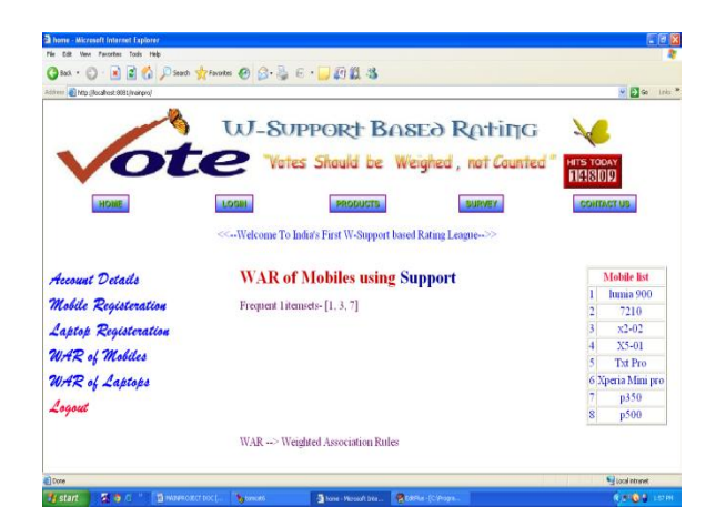
Figure 5.6 Frequent item sets using measure