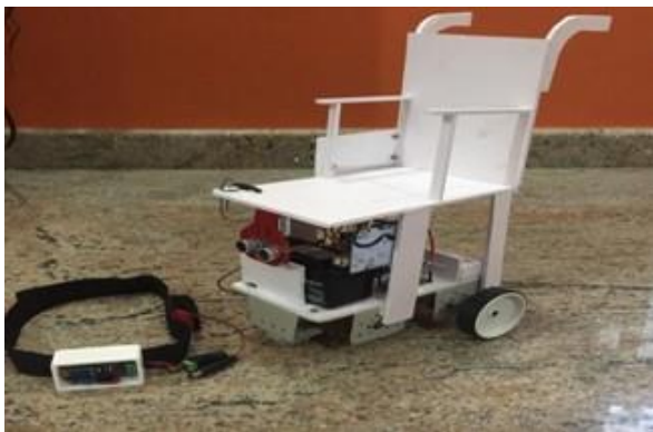
Fig. 4. Prototype of the Wheelchair

The proposed framework is expected to make a financially savvy wheelchair to assist quadriplegic with people who think that it's hard to move freely. The structure uses head advancement to control the wheelchair. The tilt focuses made are distinguished and voltages are created by accelerometer. These voltages are taken by microcontroller which in this way controls the course of wheelchair.